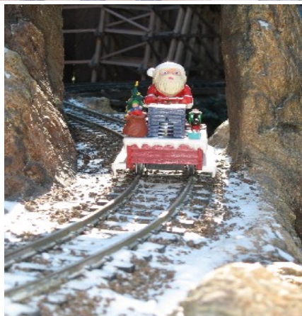
Thanks to Santa for dropping by early and posing. And for bringing the snow.