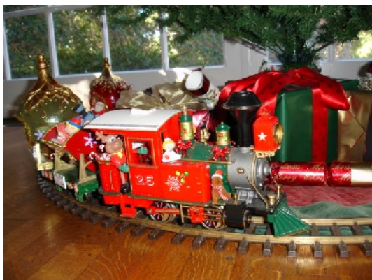
Thanks to Chris Walas for this picture. And the train, too, of course.

You know what December needs? More things to celebrate. Here are a few additional ideas: National Chocolate Covered Anything Day on the 16 th , National Maple Syrup Day on the 17 th , and National Oatmeal Muffin Day on the 19 th . I plan to save time by putting maple syrup on my chocolate covered oatmeal muffin.